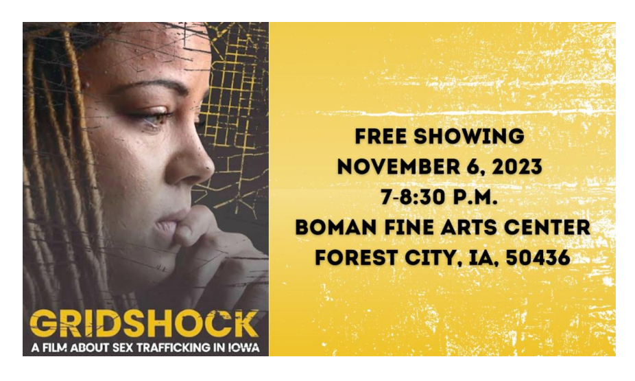
Gridshock Showing at Boman Fine Arts Center

Waldorf has organized the showing of an eye-opening movie about Iowa's participation in a worldwide epidemic – Human/Sex Trafficking. Iowa is currently ranked #3 in sextrafficking in the nation based on population. This is disturbing. We need to collectively